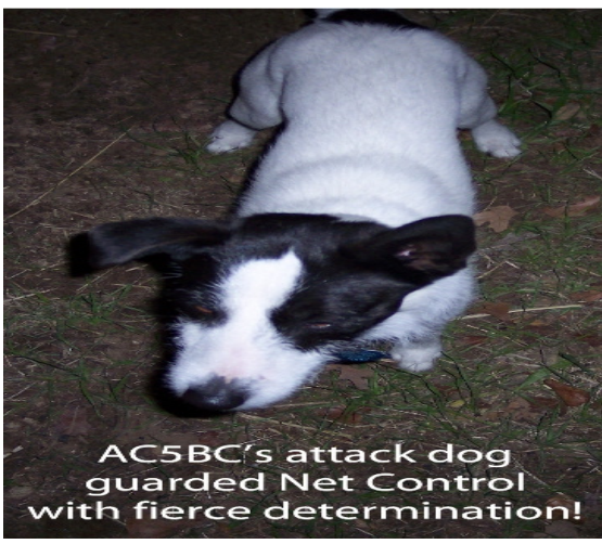
AC5BC's attack dog guarded Net Control with fierce determination!