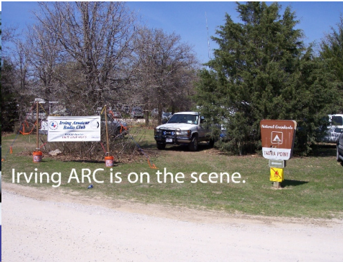
Irving ARC is on the scene.