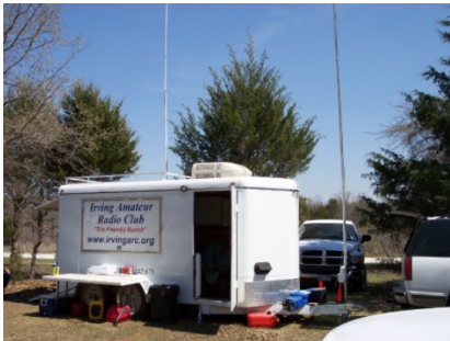
IRARC Communications Trailer