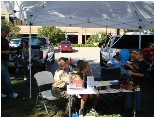
Local scouts make contacts at the JOTA station provided by the Irving ARC.

PICTURE CAPTIONS (original photos are attached)